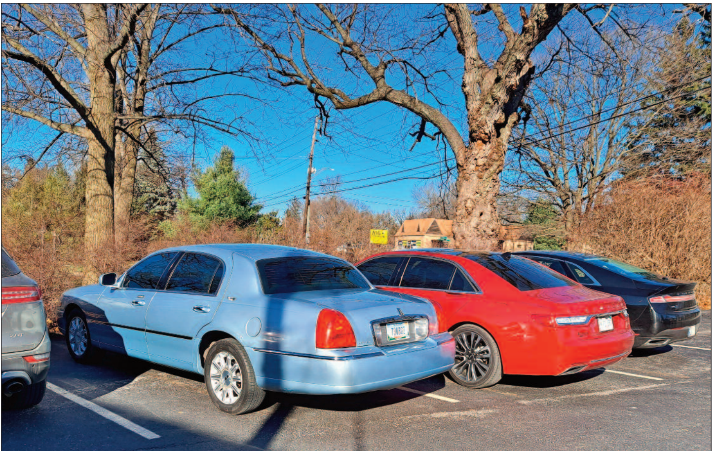
4 Lincoln Log Spring 2022