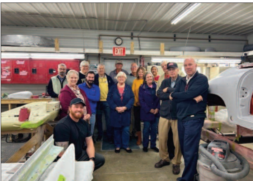
ABOVE The group was Lavine Restoration, Inc., in Nappanee.